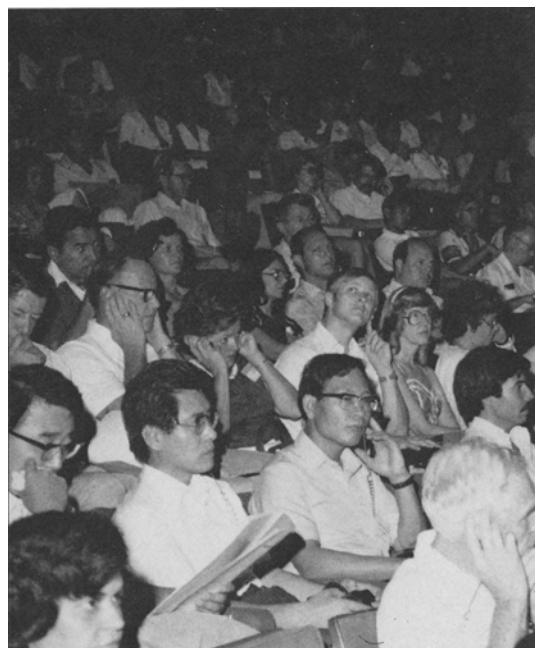
Registrants listen to simultaneous translation during opening ceremonies.

ANIAME, the Mexican soy processors group, used the occasion to hold the first general meeting of that organization since it was formed approximately 30 years ago. The event was held at the Princess Hotel, separate from the World Conference, and proved successful enough that the group has decided to meet annually. ANIAME officials were invited to attend portions of the conference and, in turn, invited some World Conference officials to their concluding banquet at the Princess. □