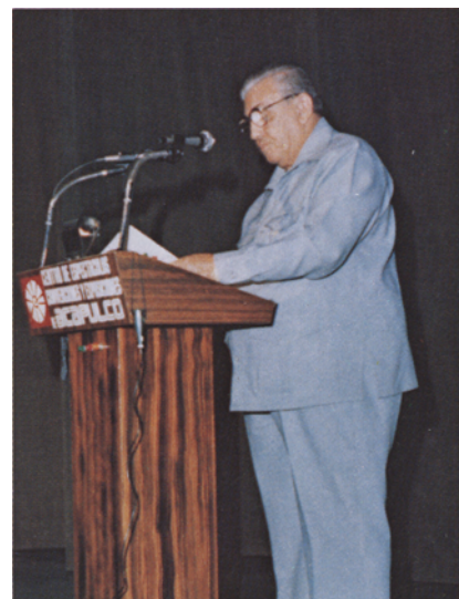
Guerrero Gov. Ruben Figueroa Figueroa at opening ceremony

Mexican President Jose Lopez Portillo, who had to cancel his participation shortly before the conference